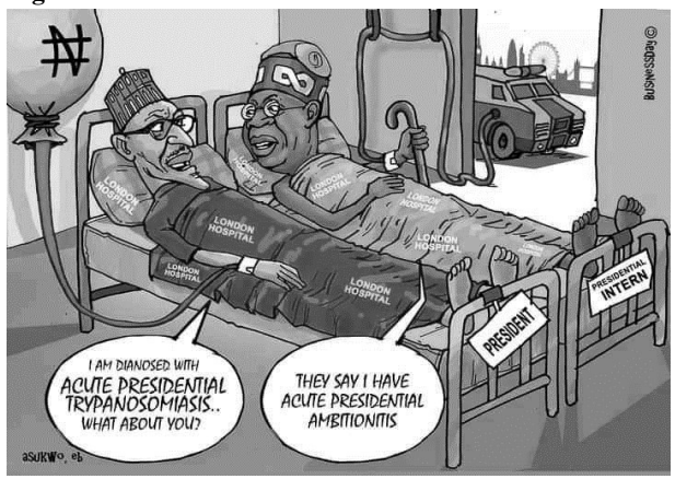
Figure 3. Presidential Clinic

Even though wearing the symbolic eyeglasses and cap designed with broken hexagons, Tinubu is poorly dressed and metaphorically represented as the feared Lagos 'Agbero' with a bottle, a weapon of choice for the Agberos. Scantily clad, he is struggling with the bus driver for the steering wheel with verbal threats of "...na my turn be this. I no mind to fight dirty..." The cartoon shows desperation and disregard in Tinubu's ambition to become Nigeria's next President. The symbols utilised in this and the other cartoons support the postulations of the visual rhetoric theory on which this study is predicated.