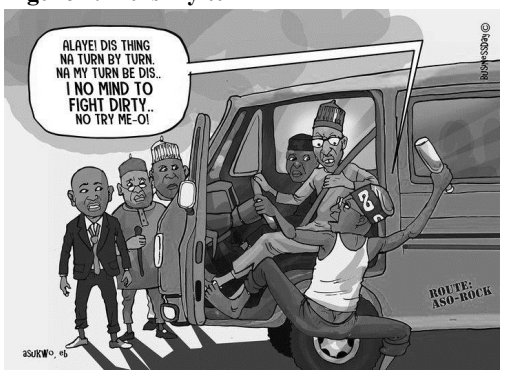
Figure 2. "It is my turn"

Iconographic Analysis: This heading analyses the images and symbols utilised by the cartoonist, given the existing environmental background and cultural milieu. Questions like, "what do you think the cartoonist's opinion on this issue is? and "what method does the cartoonist use to persuade the audience?" are reviewed in this heading.