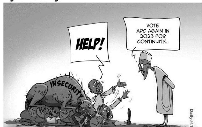
Figure 4. Vote Again?

In the cartoon under review, Bola Tinubu does not recognise his ambition; rather he accuses others by saying, "they say I have acute presidential ambitionitis (ambition)". This statement exonerates him from his ambition. The symbols utilised in this cartoon are simple and funny caricatures but express a rather sensitive issue of the "unknown" health status of Nigerian leaders.